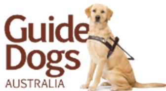
Guide Dogs Australia