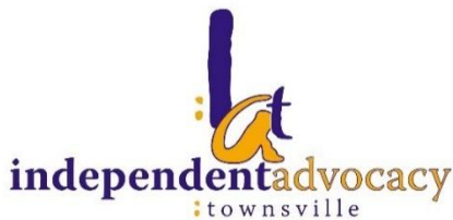
Independent Advocacy Townsville