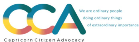
Capricorn Citizen Advocacy