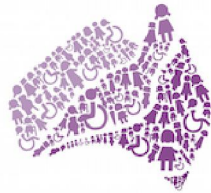
Women with Disabilities Australia